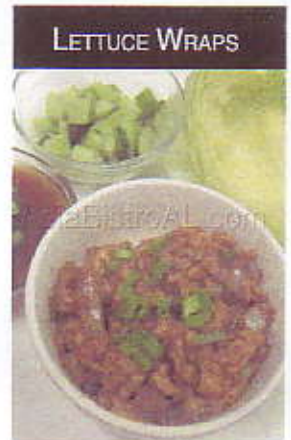
Asia Bistro has great lettuce wraps!